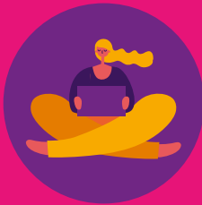
Have some 'me' time