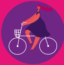
Do things you enjoy