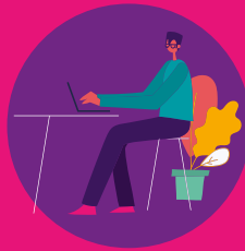
Have a back up plan