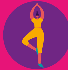
Do breathing/mindfulness exercises