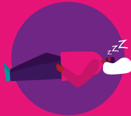
Get a good night's sleep