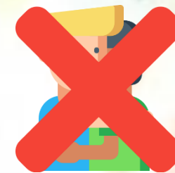
Hugging our friends