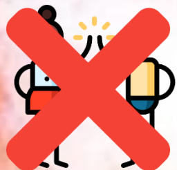
Giving high fives