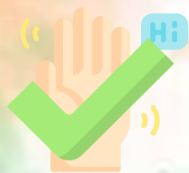
Wave to each other