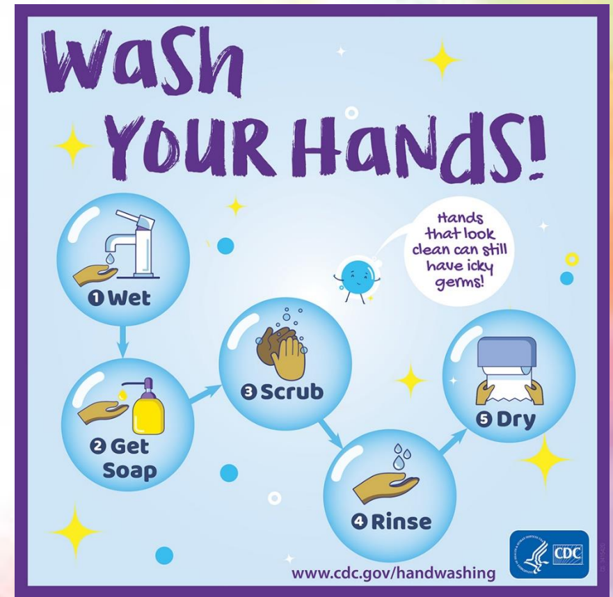
Washing my hands regularly.