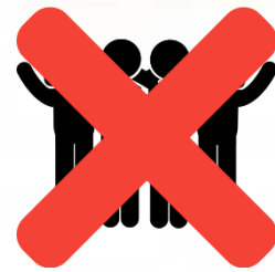
Being really close to other people