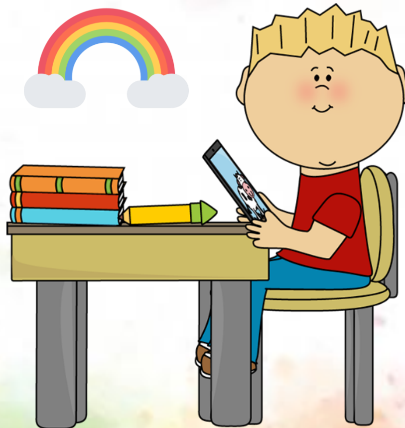
Working at my own desk.