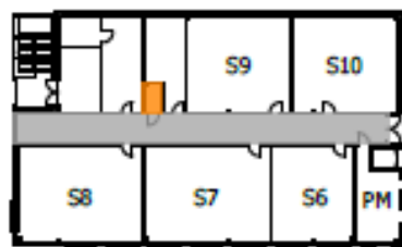
Science Block First Floor

Turn left at top of stairs for first floor Performing Art block